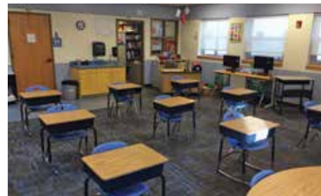
Each of the classrooms has new carpeting, desks, and chairs.