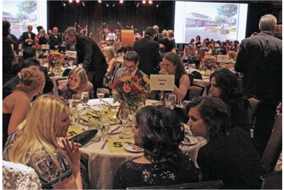
Gala attendees enjoy a delicious dinner prior to the start of the evening's entertainment.

Stay up to date with event happenings on Twitter with #silverbellball or follow @MtSaintVincent. ❤️