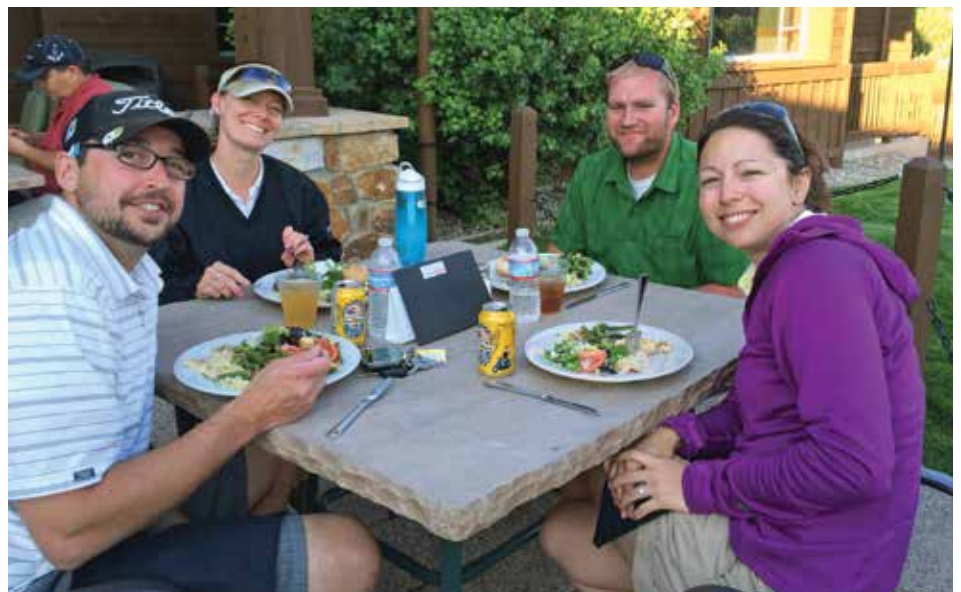
After play is over, golfers enjoy a raffle for prizes and a delicious awards dinner.