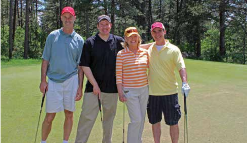
Participants enjoy a challenging 18 holes of golf at The Ridge at Castle Pines North.

"Play a Round for Kids" Charity Golf Tournament Slated for Friday, June 19, 2015